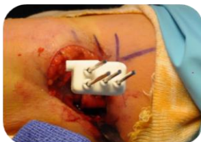
Fixator : determines the final position

The surgical guide allowed to resect the exact piece of bone needed to restore perfect realignment of the arm. The fixator ensured the correct final position of the bone parts